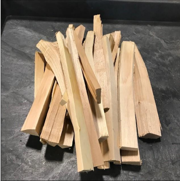
Typical Kindling Load