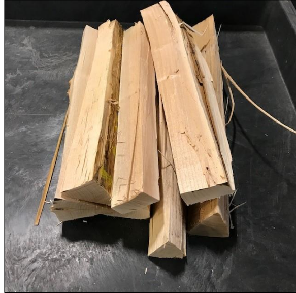
Typical Startup Load