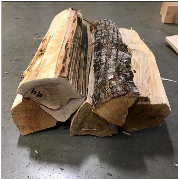
Typical High Fire Load